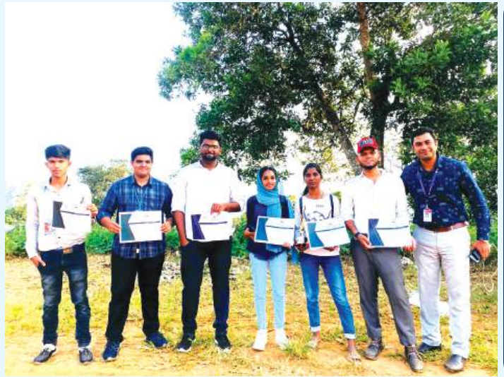
ADD ON CERTIFICATE PROGRAMMES