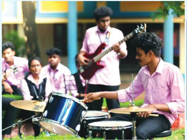
SOFT SKILL TRAINING